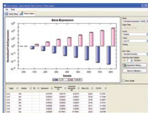
Multifile gene expression analysis. Compare C_T values from different data files using the Gene Study module in CFX Manager software.